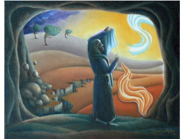
The Prophet Elijah in the cave experiences Earthquake, Wind, & Fire (1 Kings 19); Painting by Hanna S Wiles

Unwanted prescription or non-prescription eyeglasses can be put to good use in poor countries. To give someone the gift of better sight, bring glasses to the Office any time.