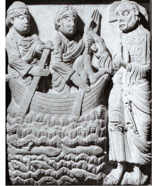
“Jesus came walking toward them on the sea...” (Matt 14) Marble bas-relief, Master of Cabestany, c1150, from Church of Sant Pere de Roda, in Museu Frederic Marçs, Barcelona

13 August, 2017 19 th Sunday in Ordinary Time